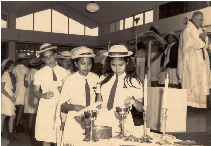
"One for me"