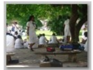
Good old School Days

Applications, which may be downloaded from our website, are available from any of our Committee members. You may also request a copy by contacting us at our Email address: ichsaatoronto@gmail.com