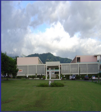
ICHS on a cloudy day

Ad Astra is published by the Immaculate Conception High School Alumnae Association-Toronto Chapter.