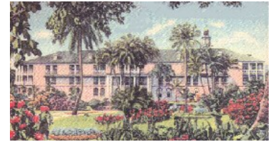
Painting of Immaculate Conception High School

HILTON SUITES TORONTO/MARKHAM 8500 Warden Avenue Markham, Ontario