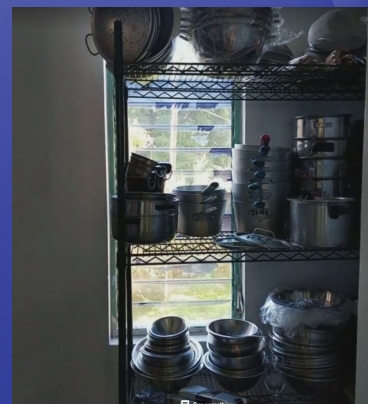
Stainless Steel Utensils