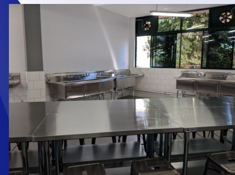
Sinks, New Windows, Extractor Fans,