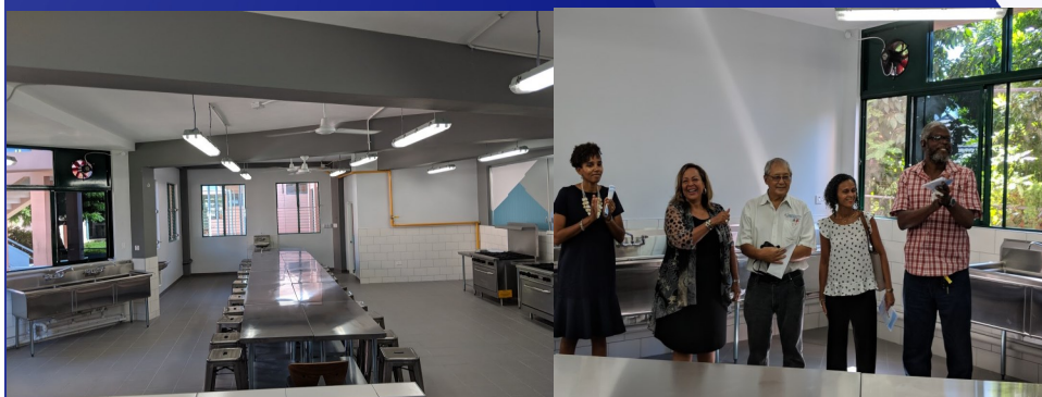
State of the Art - F/N Lab